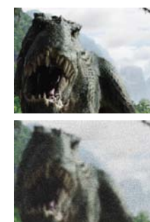
The video equivalent of jitter is a blurred image like this

DacMagic Plus reduces jitter to almost immeasurable levels, massively increasing audible quality of your digital music.